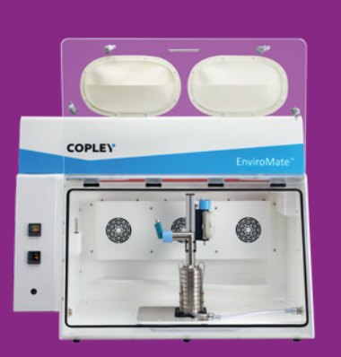
EnviroMate with Andersen Cascade Impactor (ACI)